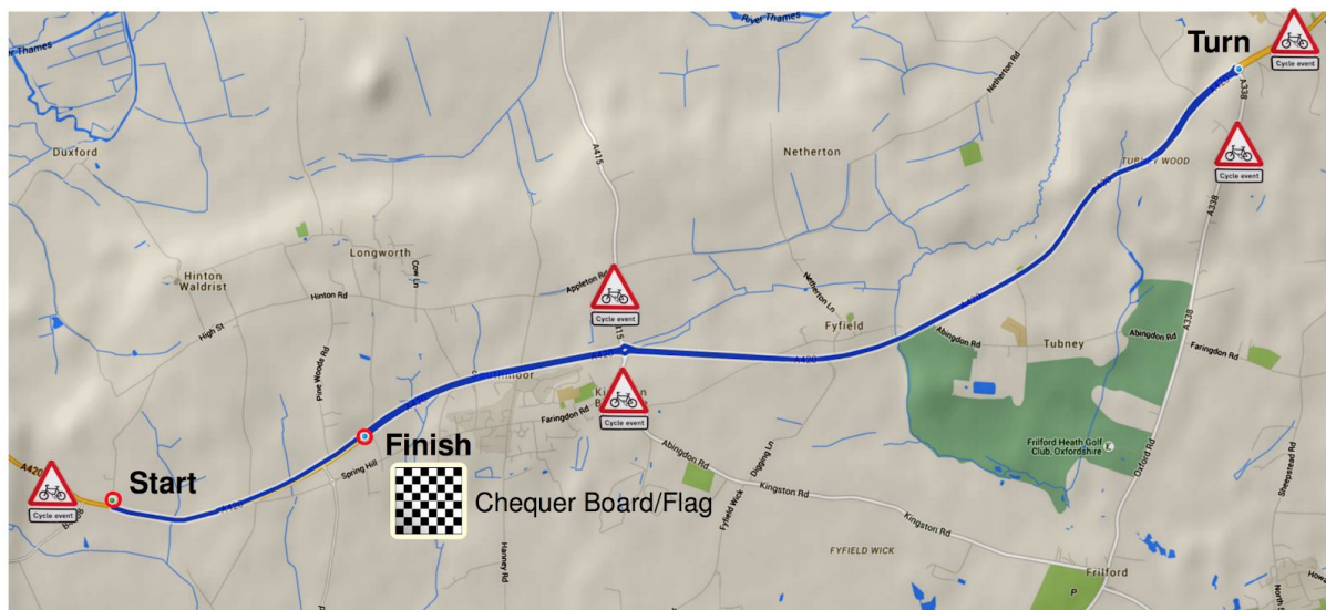
Figure 1: http://wdcriskassessments.co.uk/Courses/H10%2017R%20Kingston%20Bagpuize/H10%2017R%20course.pdf